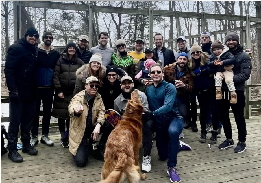
The action on the paddle tennis court has significantly increased during recent years for those who are able to take advantage of the winter weather.