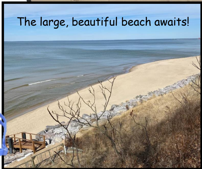
The large, beautiful beach awaits!