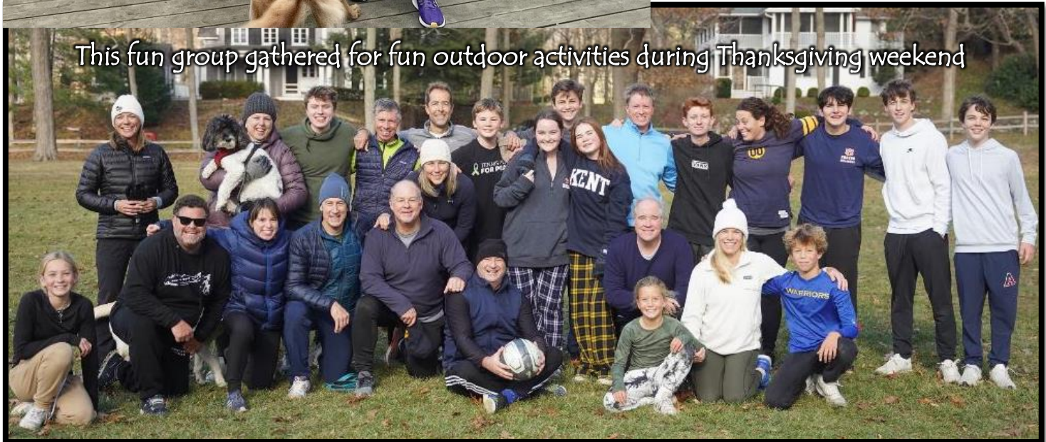
This fun group gathered for fun outdoor activities during Thanksgiving weekend