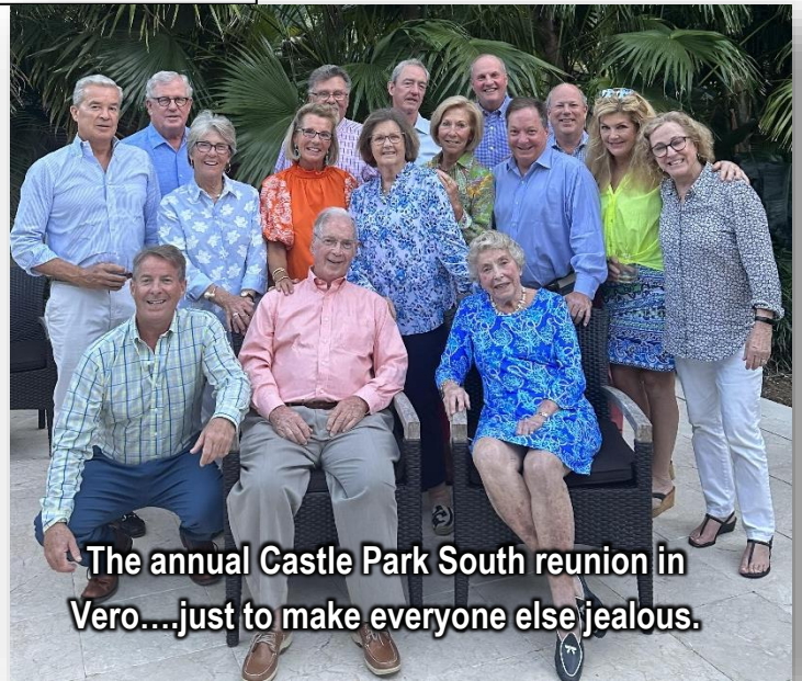
The annual Castle Park South reunion in Vero...just to make everyone else jealous.