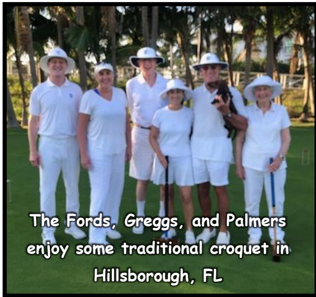
The Fords, Greggs, and Palmers enjoy some traditional croquet in Hillsborough, FL