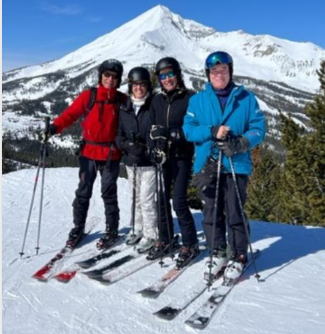
The Wendins joined the Judsons for skiing out in Big Sky, MT